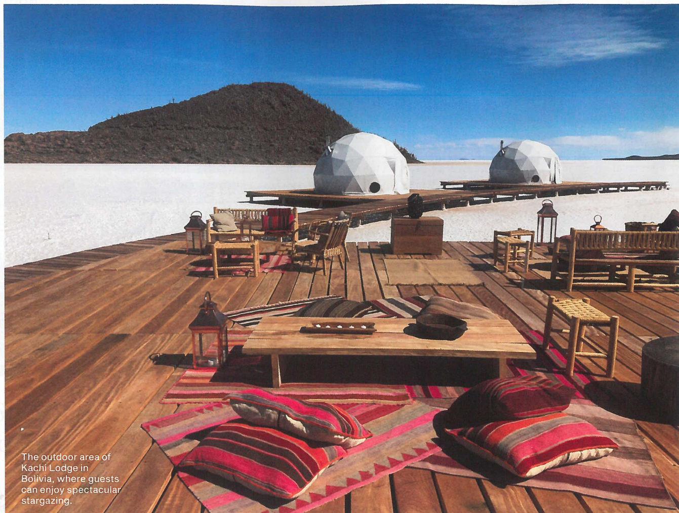
The outdoor area of Kachi Lodge in Bolivia, where guests can enjoy spectacular stargazing.